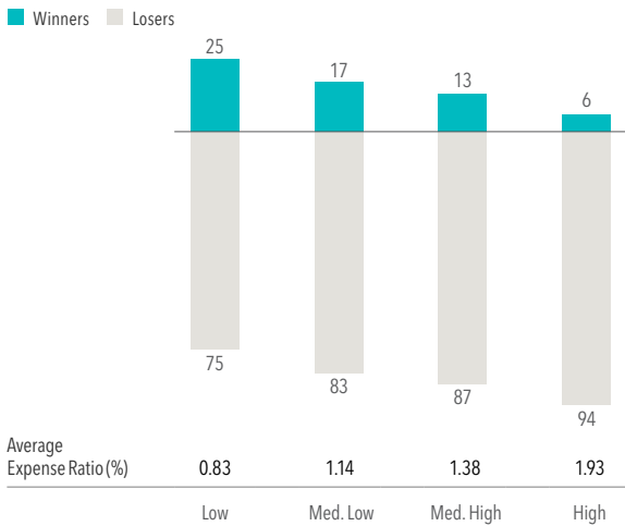
Exhibit 1: High Costs Can Reduce Performance, Equity Fund Winners and Losers Based on Expense Ratios (%)